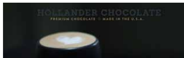
Promotional Videos Promotional video created to promote the company’s brand in Korea through events and online marketing campaigns.