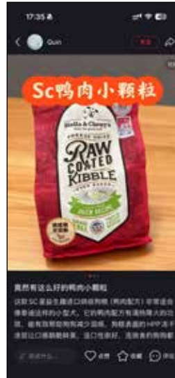
Influencer Marketing Xiaohongshu influencers created content promoting the company’s brand and products in China.