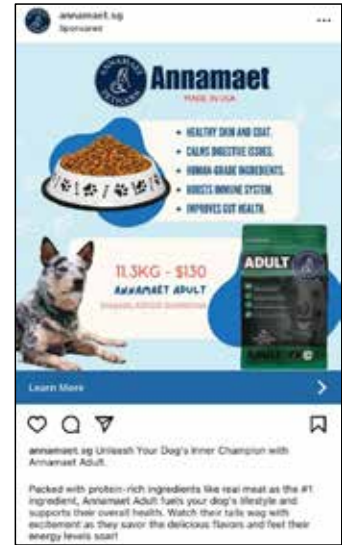
Instagram Ad Instagram advertisement promoting the company’s dog food brand in Singapore.