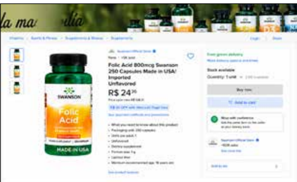
SEO Advertisement Search and display ads on Google and Amazon promoting the company’s products in Brazil.