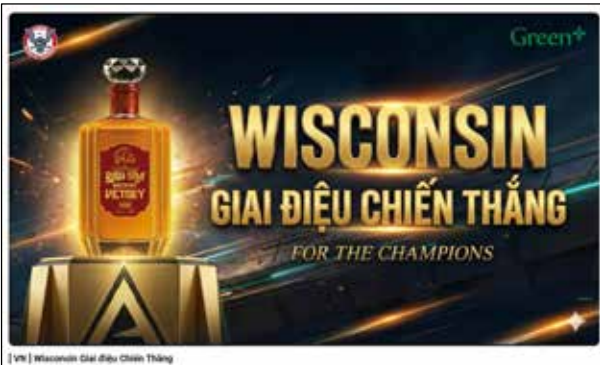
Promotional Video YouTube videos showcasing new company products at events in Vietnam.